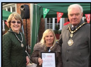
Winner of the festive shop front competition

Dates of the Annual Summer Picnic and London open house weekend Eastcote House Gardens