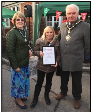
First place, Harlington Hospice