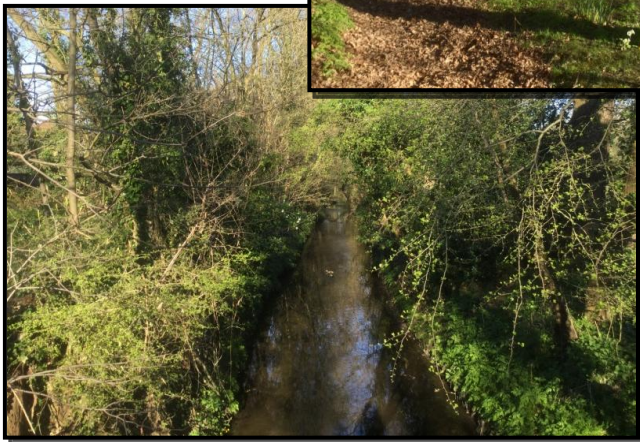
The River Pinn in Eastcote Village.