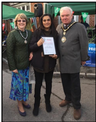
Harrow Lighting, runners-up