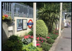
PICTURE VIEW Photos of Eastcote