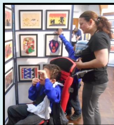
Grangewood School art exhibition

We look forward to seeing you at our Open Forum on Tuesday 15th November, details are on the inside cover.