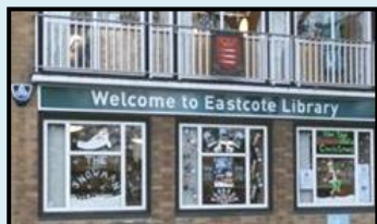
What's going on in your local library