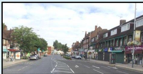
Eastcote town centre improvement