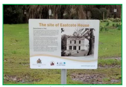
Temporary sign for the site of Eastcote House

A Frequently asked question is where did Eastcote House stand? To answer this question a temporary information board has been erected on the site of the House. A permanent display will be installed in 2018 once all Archaeological explorations are finished.