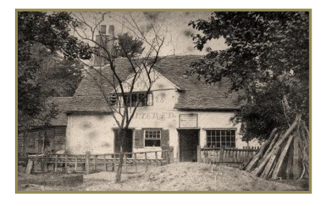
The Case is Altered